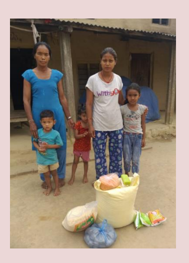
Mother and children who lost their relatives

The consequences of the worldwide pandemic are huge. In Nepal they are currently more concerned about hunger and poverty.